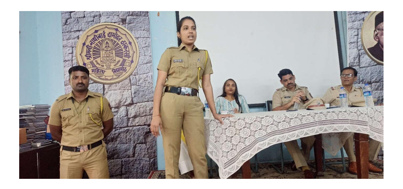
"Cyber Security and Women" Under "Azadi ka Amrit Mahotsav" With Collaboration of Churchgate Railway Police on 12<sup>th</sup> August 2022.