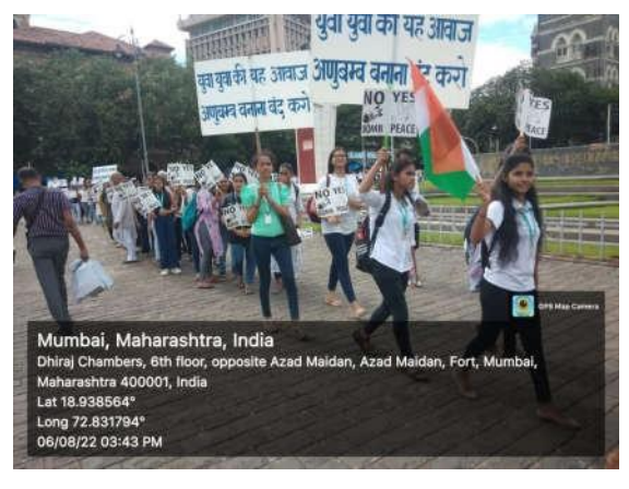
"Silent Peace Rally " to commemorate Hiroshima Day on 6th August 2022